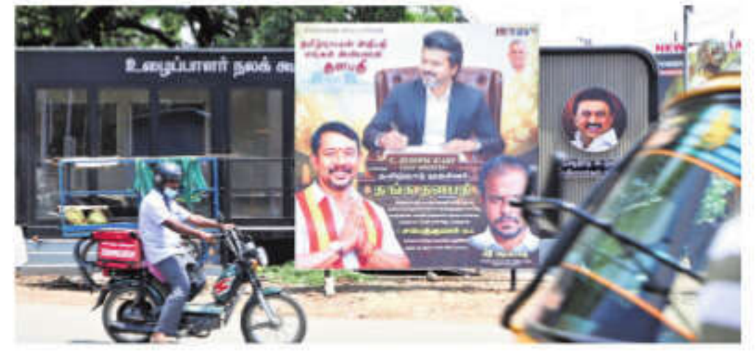
A TVK banner installed in front of a resting lounge for gig workers established at the Sanganoor Junction in Coimbatore